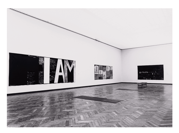
Under Capricorn. The World Over , Stedelijk Museum Amsterdam, 1996. Installation view shows Victory over Death 2 1970 (pages 110–111), The Shining Cuckoo 1974 (page 127) and A grain of wheat 1970 (TCMDAIL No. 001022).

In October 1993, the McCahon Family Trust offered for sale I considered all the acts of oppression 1980–82, the so-called 'Last Painting', at Webb's auctioneers in Auckland. The resulting price of NZ$511,750 created a new record for a work by McCahon, a figure due largely to the presence of Australian bidders and reflecting the internationalisation of the audience and market for the artist.